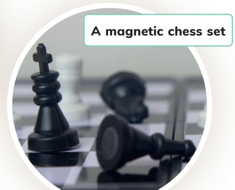
A magnetic chess set